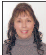
First Transit/TriMet LIFT Region 1 As reported by KATHLEEN BROWN