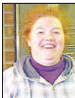
Portland Public Schools As reported by CHARISSE WALL