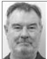
TriMet Light Rail Transportation

We think it is time for the District to quit trying to balance their budget on the backs of union members. Oh yes, they are still trying to do that three years after the strike. We sent a loud and clear message to them then. It looks like they have forgotten the message.